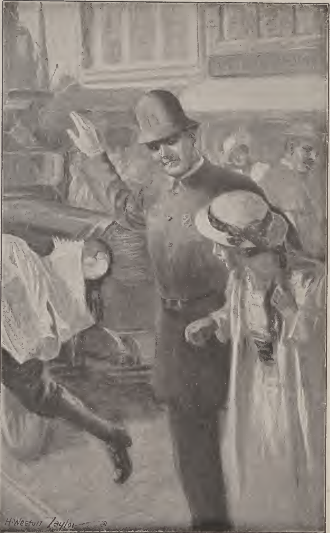
“ TWICE AGAIN, AFTER SHORT INTERVALS, SHE TROD THE FASCINATING WAY ”